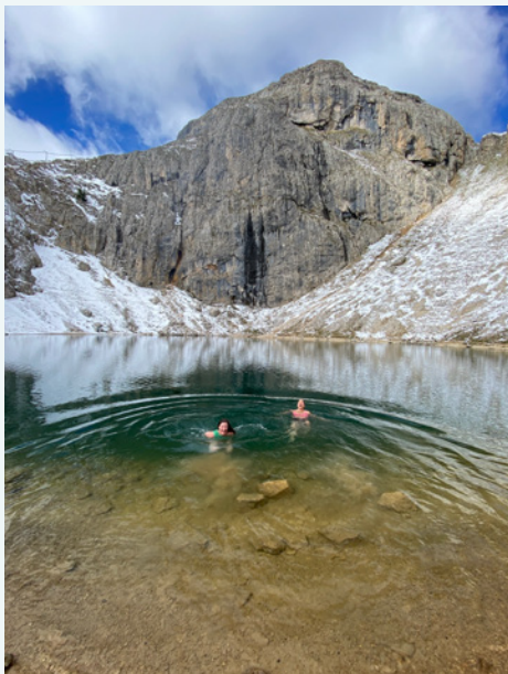
Cover and this page: Courtesy Indagare

Explore the awe-inspiring landscapes of the Italian Dolomites, a UNESCO World Heritage Site , and develop your fitness on daily guided six-mile hikes with Indagare founder Melissa Biggs Bradley and expert local mountaineers.